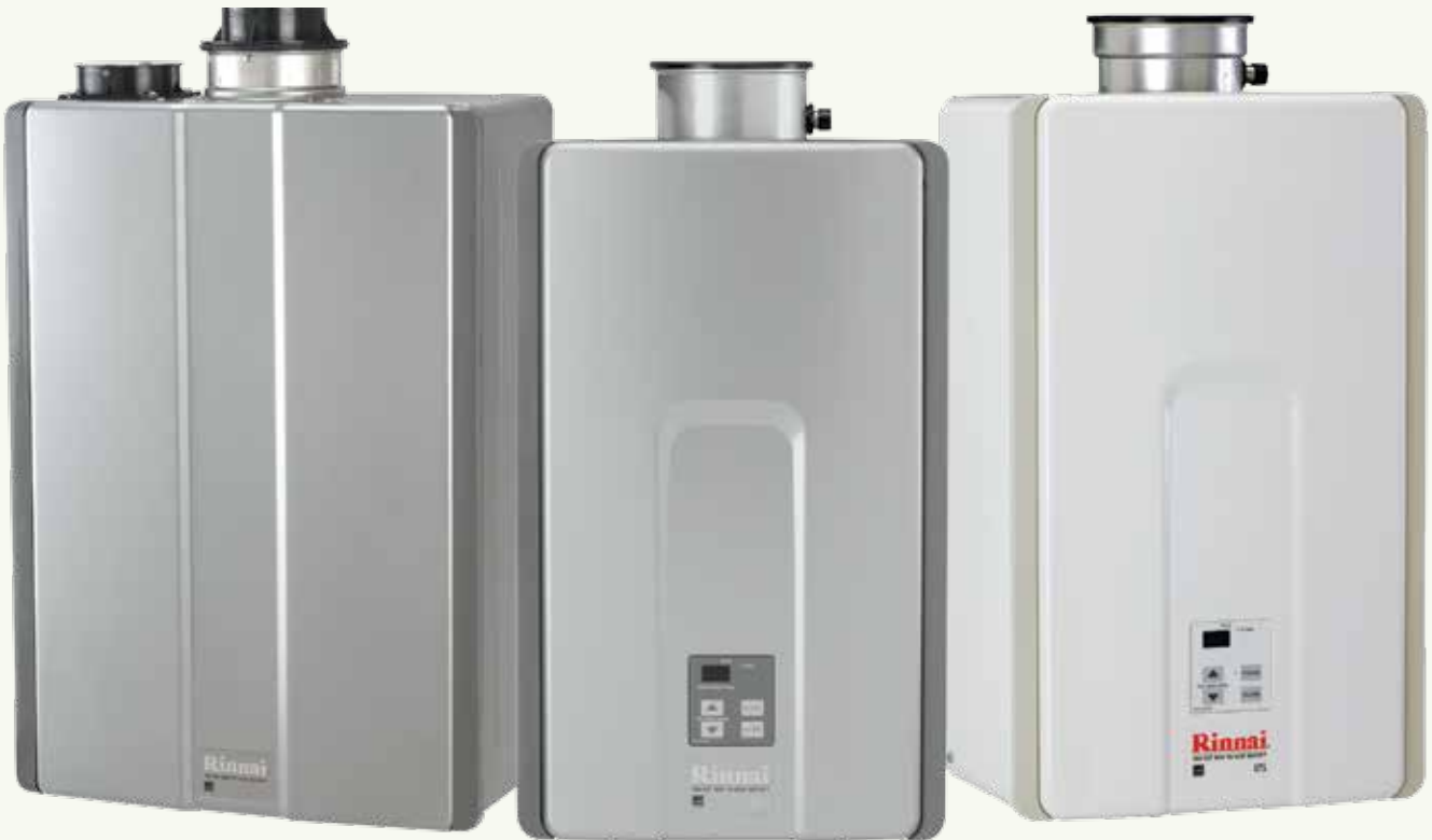
Tankless water heaters, such as this model from Rinnai America Corp., are helping homeowners save big on energy bills.