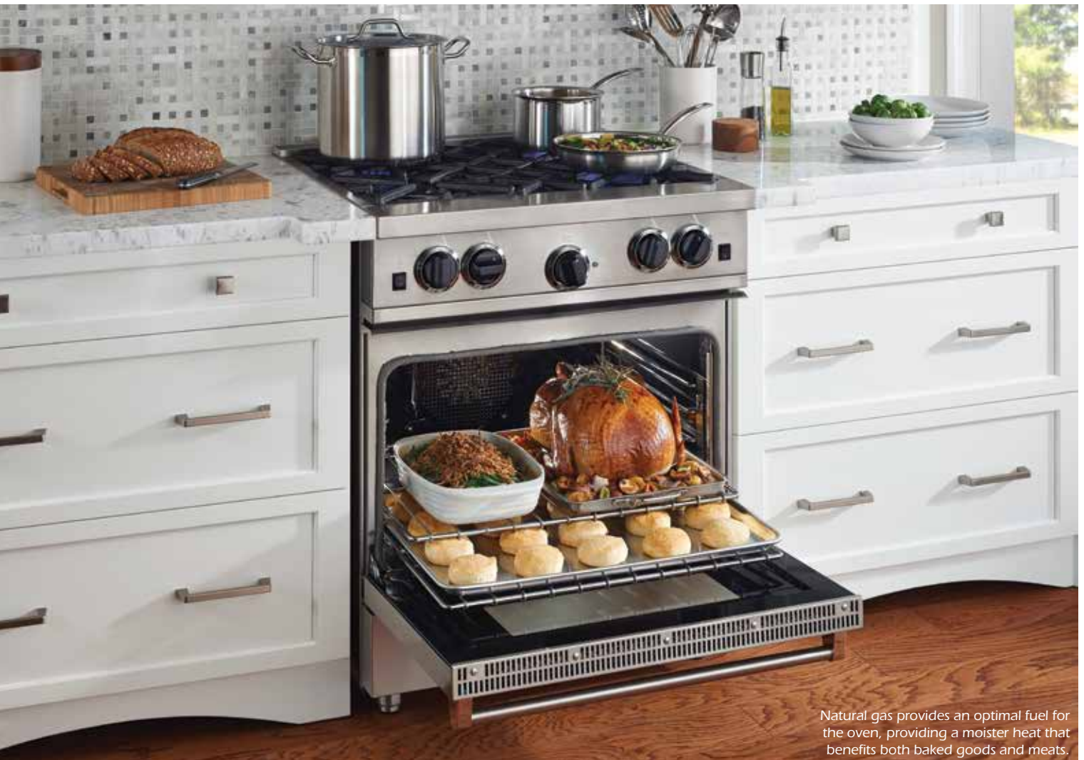
Natural gas provides an optimal fuel for the oven, providing a moister heat that benefits both baked goods and meats.

Professional chefs rely on natural gas primarily because it offers superior temperature control. Unlike electric burners, which take time to heat up, a natural gas burner heats up immediately. And, when the burner