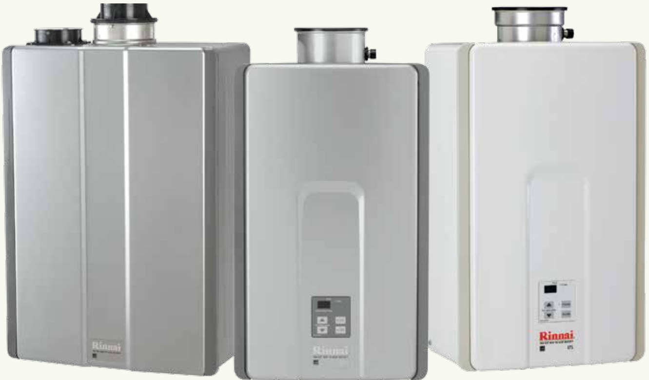
Tankless water heaters, such as this model from Rinnai America Corp., are helping homeowners save big on energy bills.